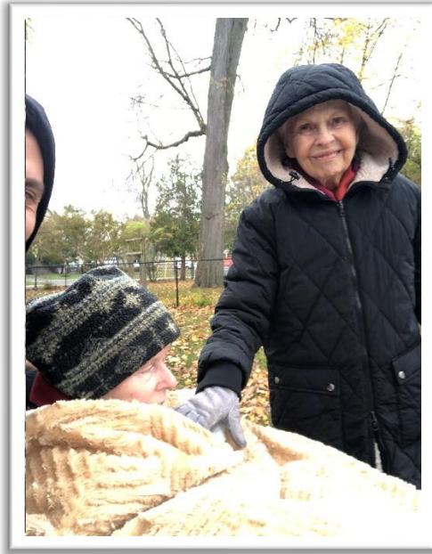
As we enjoy some of our last walks of the year.